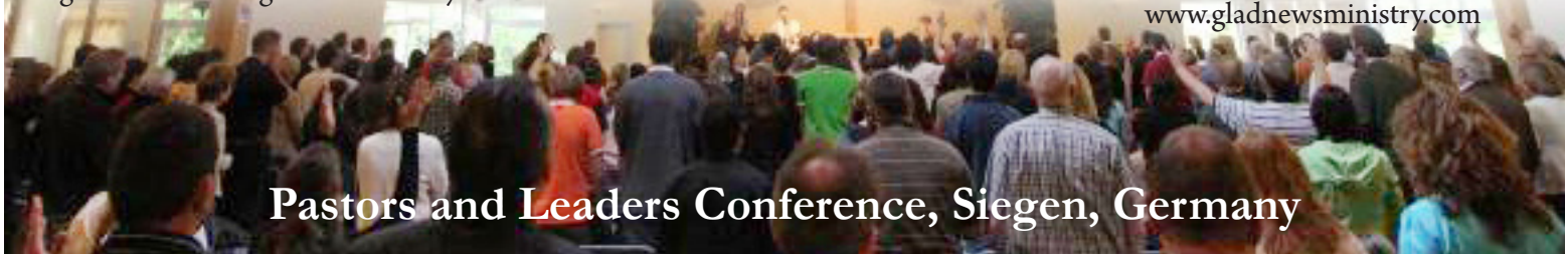
Pastors and Leaders Conference, Siegen, Germany